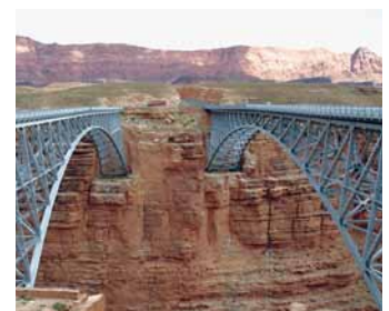
Hoover Dam Bridge