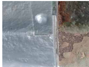
Rust Grip® requires minimal preparation and no white sand blasting of the surface.

After one application, it can penetrate deep into and seal the surface, blocking corrosion quickly and effectively.