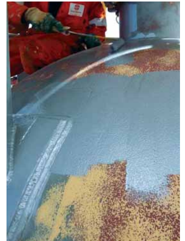
Rust Grip® penetrates deep into the pores of and seals the surface from further corrosion.

Corrosion prevention and protection for the past 50 years has yielded inefficiencies for industries that depend on critical infrastructure. With many of these methods, limited success is achieved because most corrosion coatings are “glue-on-to-surface.” This process doesn’t allow for corrosion to be controlled in the pores of applied surfaces and won’t protect against mold and mildew among other environmental toxins