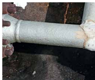
Corrosion Under Insulation