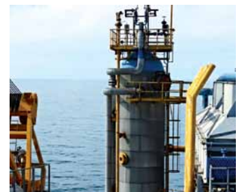
Offshore Drilling Rig