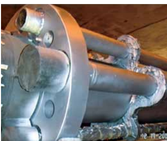
Drill Pipe Risers