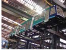
Rust Grip® is tested to encapsulate rust, lead-based paint, asbestos and biohazardous materials.

The one-coat application process behind Rust Grip® makes it an efficient and adaptable solution for companies.