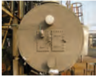
Incinerator before HPC® Coating application was 356°F (180°C).