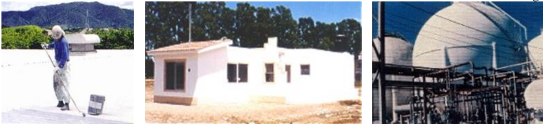
FIGURE 2 SUPER THERM APPLICATION (METAL ROOF/ CONCRETE WALLS/ SURFACE OF STORAGE TANKS)

Other specific uses of SUPER THERM are for: