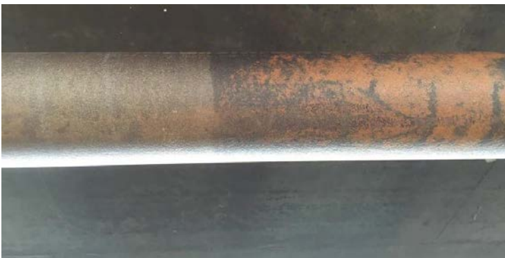
Pipe shown above returned from a completion well project

Since 2015, Workstrings has coated over 1,000,000 feet (30,000 Joints) with zero tube corrosion downgrades